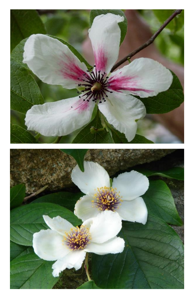
Figure 1a. Stewartia malacodendron 'Delmarva' courtesy of The Polly Hill Arboretum, Tisbury, MA; Figure 1b. Stewartia ovata 'Red Rose' courtesy of The Polly Hill Arboretum, Tisbury, MA.

Stewartia is a genus of flowering shrubs and trees in the family Theaceae. Stewartia species are native to eastern Asia, with the exception of two species, S. ovata and S. malacodendron , which are indigenous to southeastern North America. All species have large and showy flowers that are 3-11 cm in diameter, usually with 5 white petals (Figures 1a, 1b).